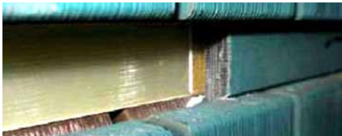
Figure 3. Incorrectly Installed Wedges

Company: Midwest US Utility Ratings: 173 MW, 18 kV, Hydrogen Cooled Turbine Generator, 3 years in operation